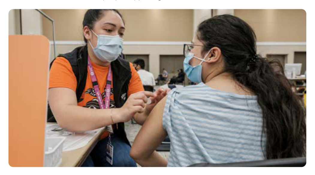
British Columbians rolled up their sleeves as part of the largest immunization program in our province's history.