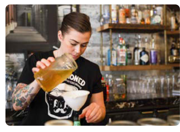
When COVID-19 arrived in B.C., our government worked quickly to protect people and help see businesses through to the other side of the pandemic.