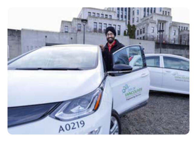
British Columbia is leading the charge in North America on the switch to electric vehicles.