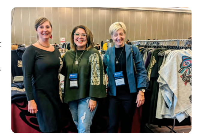
Indigenous businesses throughout the province now have a dedicated Export Navigator advisor to help them grow by reaching new markets outside of B.C.