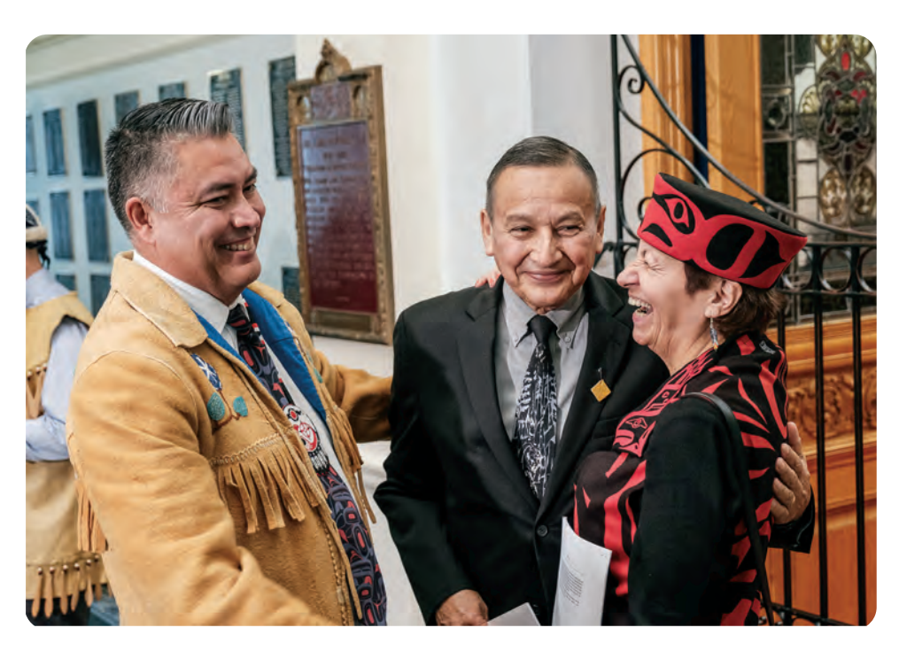
Our province is the first to pass legislation to implement the UN Declaration on the Rights of Indigenous Peoples.