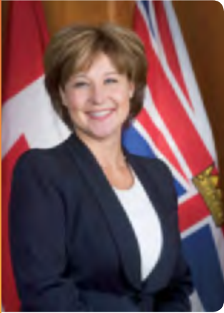
Honourable Christy Clark, Premier of British Columbia

I present to you the Strategic Plan 2014/15 – 2017/18, to accompany our second consecutive balanced budget. I am proud to lead one of only two jurisdictions in Canada that has seized the imperatives of small government and controlled spending. My government is demonstrating our respect for British Columbia's taxpayers and our commitment to future generations by ensuring our programs are sustainable, affordable, and do not create a burden of debt for our children. I am determined to protect and preserve our province's triple-A credit rating, and to ensure we continue to save taxpayers millions of dollars every year through reduced borrowing costs.