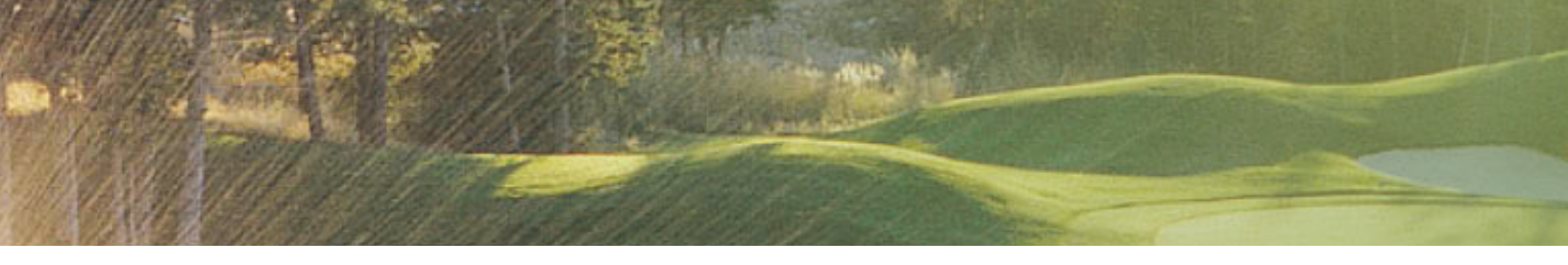
GOAL 4: Business Efficiency – Conduct our business efficiently in a changing environment.