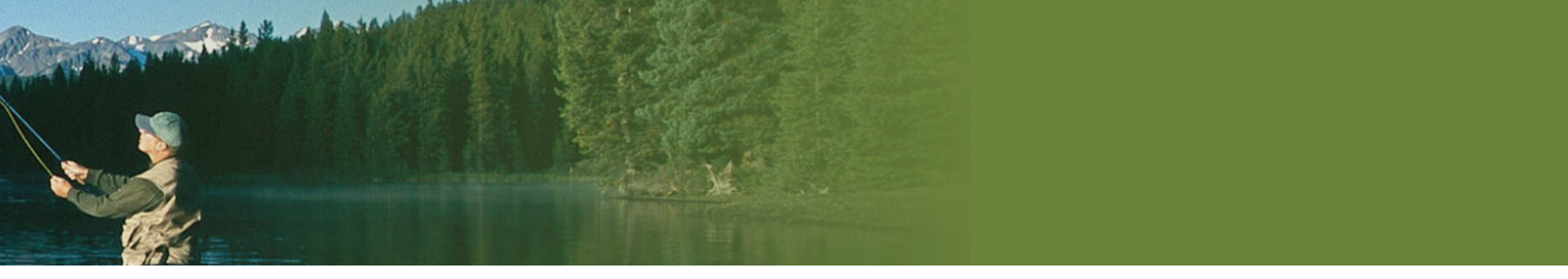
GOAL 1: Attract Visitors to increase tourism industry revenue.