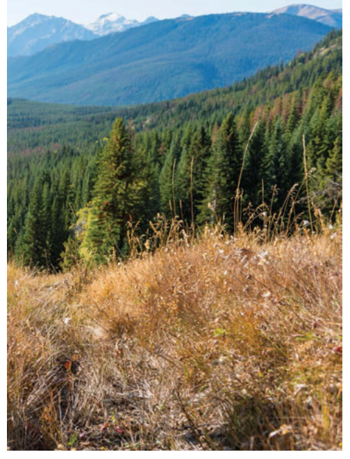
South Chilcotin Mountains Provincial Park