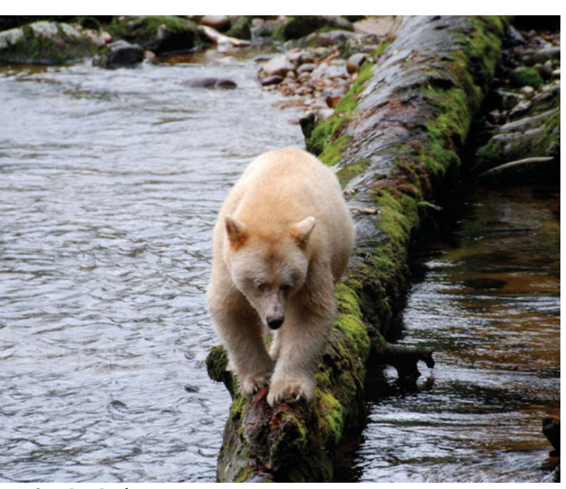
Great Bear Rainforest

The specific objectives and strategies will be further refined by the Destination BC Board of Directors during 2014/15 as a new strategic marketing plan is developed.