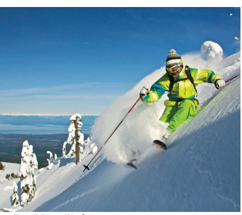
Mount Washington Alpine Resort

\label{eq:DataSource:Destination BC and third party independent research firm. \\