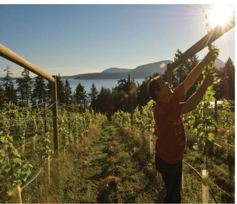
North Pender Island

Individual biographies of the Board Chair and Directors can be found here .