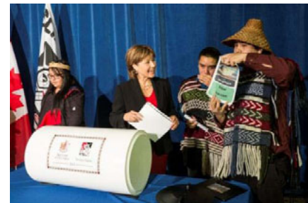
Looking forward to a future under self-government, youth members of the Tla'amin Nation were joined by Premier Christy Clark as they placed personal mementos into a time capsule, celebrating the introduction of provincial legislation to ratify the Tla'amin treaty.