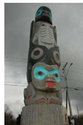
The unveiling of a totem pole, part of reconciliation Journey ceremony with Tseycum First Nation.