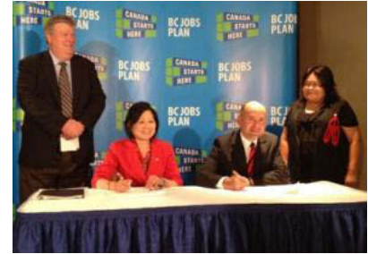
Former Minister Ida Chong, Haisla Nation Council Chief Councillor Ellis Ross and Minister of Natural Gas Development Rich Coleman at the signing of the Haisla Framework Agreement.

The ministry has initiated expenditure restraint measures, including adhering to government-wide Managed Hiring Guidelines, travel restrictions, and other operating cost- management initiatives to achieve efficiencies and savings to support the government's commitment to balance the budget in fiscal 2013/14. The ministry is committed to meet its fiscal objectives while minimizing negative impacts on service levels to its stakeholders.