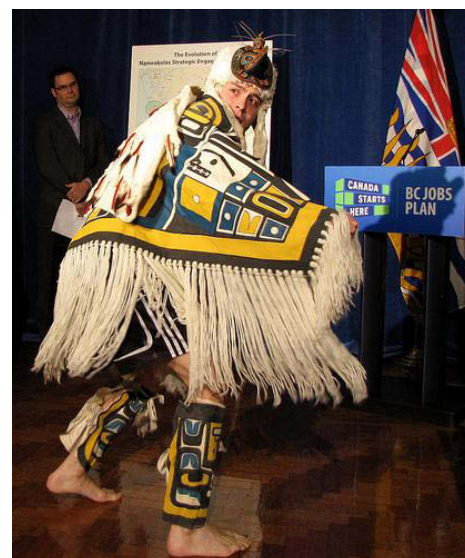
A cultural performance and blessing open the event celebrating the renewal of the Nanwakolas Strategic Engagement Agreement at the Legislature in Victoria.