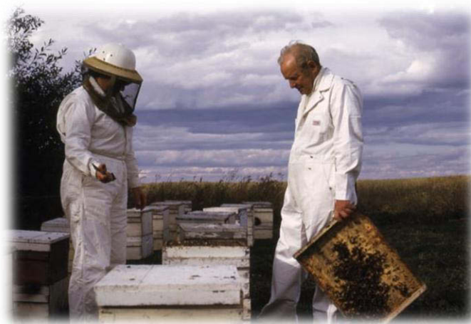
Beekeepers are shown here with their bees. Healthy bees are critical to agricultural production.

Beneficial Management Practices will only qualify for Growing Forward 2 funding if they are identified in approved Environmental Farm Plans (see Performance Measure 2). These projects focus on minimizing farm impact on water quality and quantity, energy use and climate change issues such as greenhouse gas production. Examples of Beneficial Management Practices include the installation of thermal curtains in greenhouses to reduce heat loss and CO 2 e production and the change in type of equipment used, which can reduce fuel consumption and contribute to CO 2 e savings.