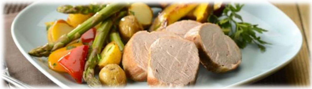
Lean B.C. pork with roasted vegetables

The Ministry is committed to supporting government's key priorities for families, jobs and the economy, and open government. Part of this involves implementing the agrifoods strategy, which is part of the Canada Starts Here: The BC Jobs Plan . The Ministry worked with industry to develop this strategy, launched in March 2012, to leverage opportunities and accelerate growth in the agrifoods sector. As part of the commitment made under the BC Jobs Plan , the Ministry commissioned a special report to identify opportunities for growth and innovation in the greenhouse industry and is following up on the resulting recommendations.