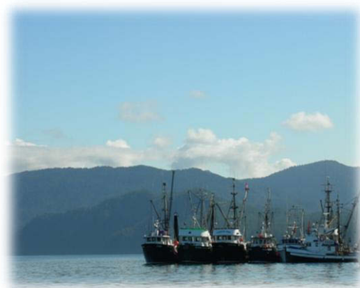
Some of B.C.'s 2,700 fishing vessels which harvest fresh seafood