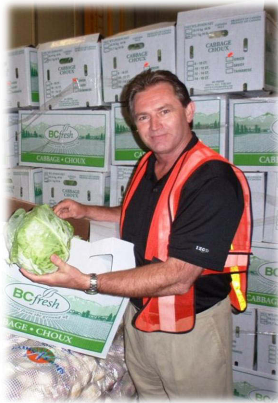
The B.C. fruit and vegetable industry supplies local and other markets with high quality produce.