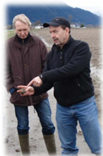
Ministry staff member provides technical information on soil management on farm in the Fraser Valley, B.C.