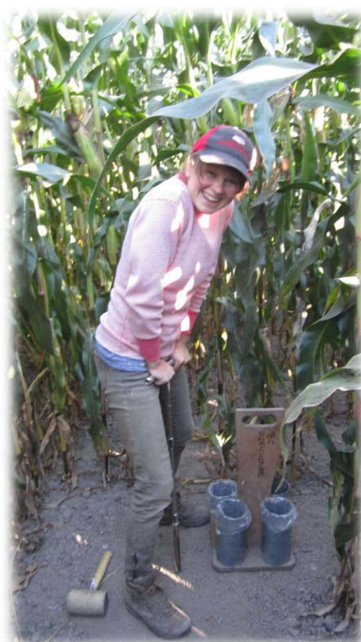
Ministry staff member collects a soil sample from a corn field in the Fraser Valley as part of the 2012 Fraser Valley Soil Nutrient Study.