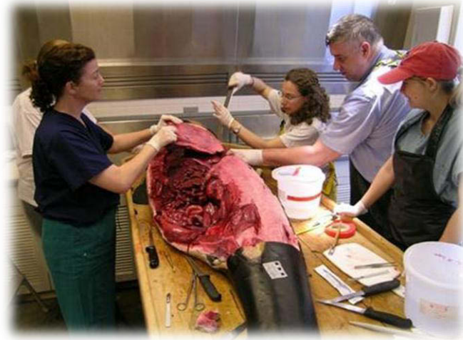
The Abbotsford Agriculture Centre's Animal Health Centre provides valuable necropsy services for the sector.

B.C. has an enviable reputation as a leader in the production and processing of a wide range of safe, high-quality agrifoods products.