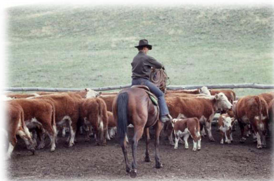
Ranching is an important component of the B.C. agrifoods sector.