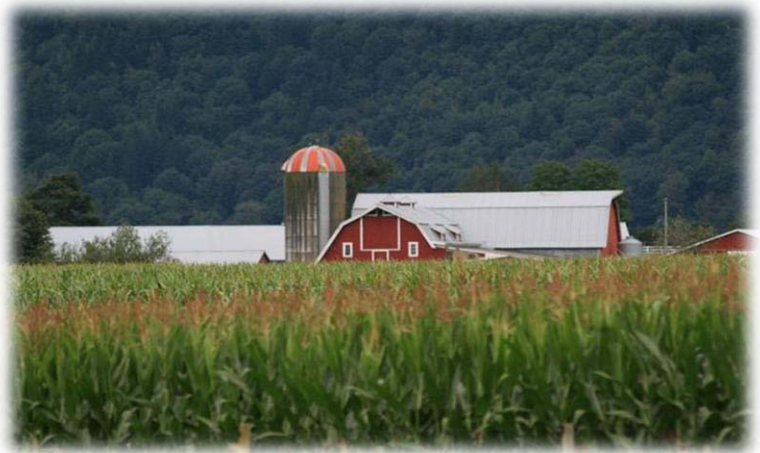
Farm in the Fraser Valley, B.C.