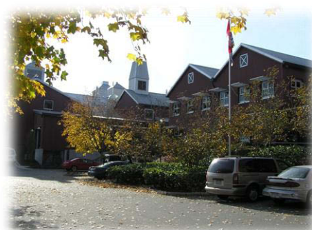
Abbotsford Agriculture Centre, with Animal Health Centre (Containment Level 3) on left