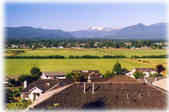
Urban development alongside an agricultural area, Comox-Strathcona, Vancouver Island, B.C.