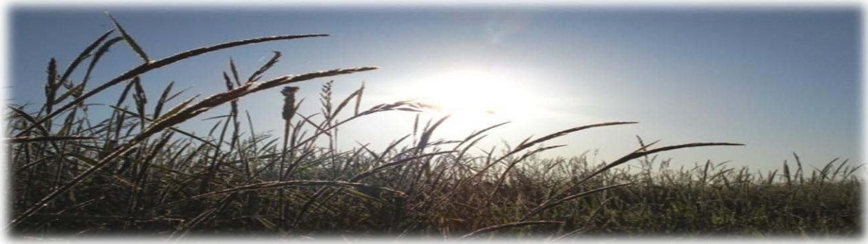
Early Morning in Fraser Valley fields