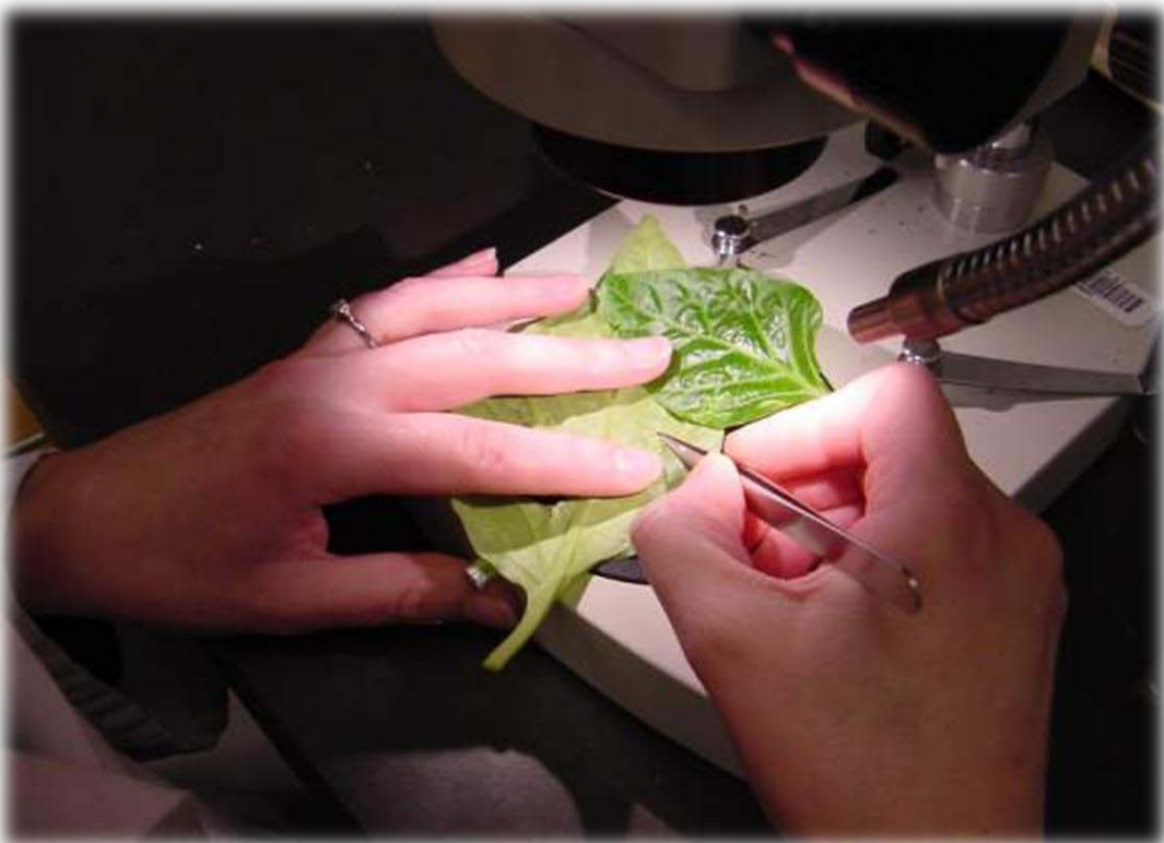
Plant health diagnoses, performed at the Abbotsford Agriculture Centre, support early detection of new insect and disease threats.

The Abbotsford Agriculture Centre houses the Animal Health Centre and the Plant Health Diagnostics Laboratory. The Animal Health Centre is a veterinary diagnostic laboratory, with a mandate to diagnose, monitor and assist in controlling and preventing animal disease in B.C. Although primarily concerned with food-producing animals, the Centre also provides diagnostic services for companion animals, wildlife, zoo animals and marine mammals. Submissions are made to the laboratory by veterinarians, livestock producers, government agencies, humane societies, zoos, aquariums and members of the public. The Centre offers a wide range of veterinary laboratory tests on a fee basis to diagnose disease and other causes of poor production or mortality in animals. Samples from wildlife, marine mammal and Society for the Prevention of Cruelty to Animals investigations are also regularly submitted to the Centre for examination and diagnostic tests.