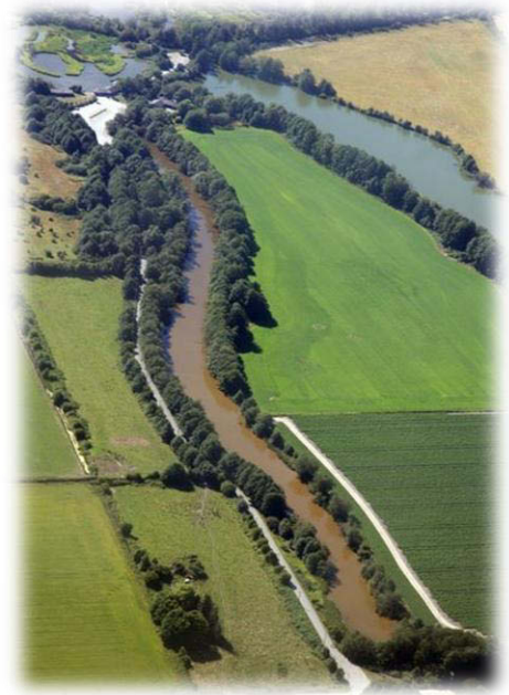
Aerial view of farming in the Fraser River Delta

The Ministry will work with the Ministry of Environment on the review of the Agricultural Waste Control Regulation, the Organic Matter Recycling Regulation and the Packaging and Recycling Regulation over the next year. The Ministry also expects to continue to provide agricultural perspectives to the Agricultural Water Committee through fiscal 2013-14. This Committee