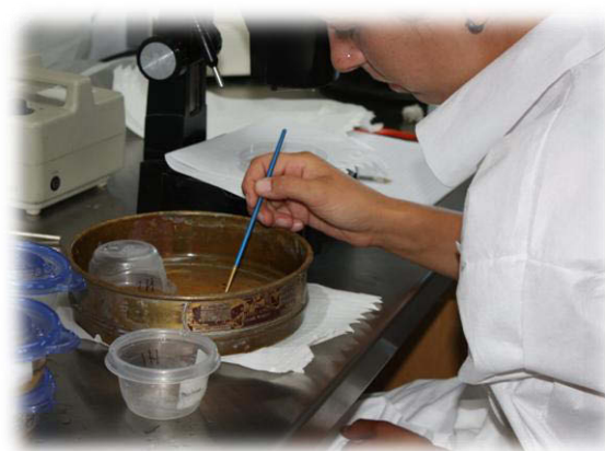
The Plant Health Unit monitors pest outbreaks and conducts surveillance for non-native invasive pests.

The Plant Health Unit advises growers on the best management practices for pest control and provides training for safe use of pesticides. This training enables registration of low risk products. The Plant Health Diagnostic Laboratory provides plant health diagnoses and helps to fulfill the Plant Health Program's mandate of providing programs and services to promote plant protection. The Plant Health Diagnostic Laboratory receives samples from growers of all commodities in B.C., pest management consultants, industry groups, home gardeners and the general public. In collaboration