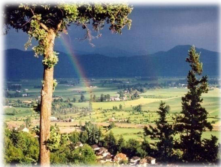
Rainbow over Sumas Prairie, Fraser Valley, B.C.

Note that previously, Performance Measure 3 was the number of completed Beneficial Management Practices. The number of completed Environmental Farm Plans has now replaced the number of completed Beneficial Management Practices. The plans/assessments are considered to more accurately reflect the outcome than are the Beneficial Management Practices.