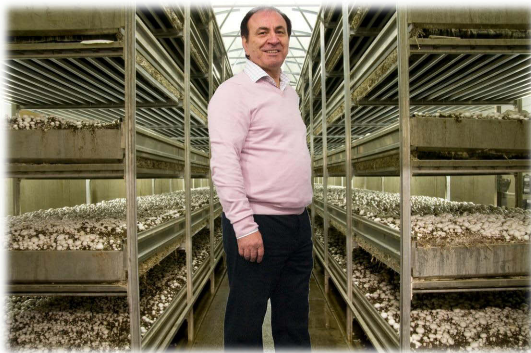
A wide range of mushrooms are cultivated or wild-harvested in B.C.

For more information about the Ministry of Agriculture, including full contact information, visit our website at: www.gov.bc.ca/agri/