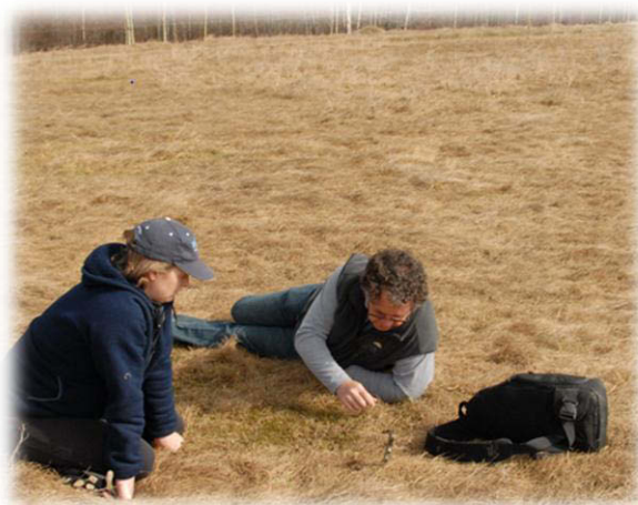
Ministry staff members regularly evaluate field conditions across the province. Here staff members are looking at the impact of wildlife on a creeping red fescue stand in the Peace.

Production Insurance administrative costs vary widely between provinces. Provinces with diverse types of crops and relatively low farm cash receipts, such as B.C., tend to have relatively higher program costs than do provinces with homogeneous crop production and higher farm cash receipts. The value of the crops produced is also significant when considering administrative costs. Production Insurance, as with all insurance, must incur administrative costs to protect the program from abuse and adverse selection. Failure to do so results in high claim rates which cause higher producer premiums and overall program costs. At the national