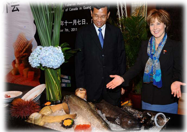
B.C. seafood is sought after in local, Canadian and international markets. Here, Premier Christy Clark promotes B.C. seafood in Asia.

markets where Canada is now negotiating bilateral and multilateral agreements. International and national competitors, with similar or lower cost structures and larger economies of scale, will likely continue to squeeze profit margins for B.C.'s producers and processors. In the agrifoods sector, where over 85 per cent of the seafood is destined for the export market, there is a strong focus on maintaining access and competitive advantage in global markets, necessitating quick responses to changing market opportunities. In 2011, B.C.'s agriculture, fisheries, aquaculture and processing sectors provided almost 61,000 jobs and $10.9 billion in annual revenue. This is building to the 2017 target of $14 billion of annual revenue. The nearly 20,000 farms had total farm gate receipts of $2.6 billion in 2011, and offered 26,100 jobs. The 745 aquaculture operations contribute $465 million in farm gate sales, while sales from the 2700 commercial fishing vessels were $345 million, and offered a combined total of 4100 jobs. The 1400 processors handled a wide range of agricultural and seafood products, employed an estimated 30,300 people and generated nearly $7.5 billion in sales.