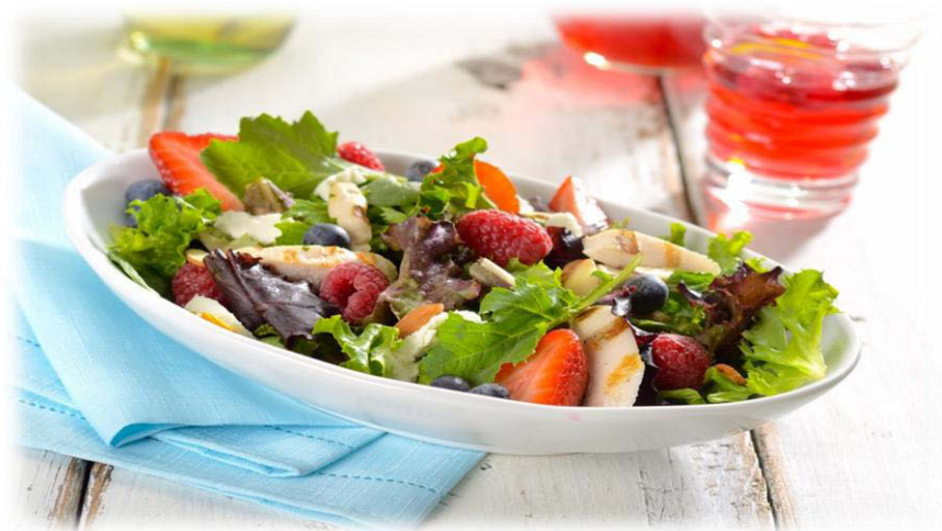
B.C. chicken with berries and greens.