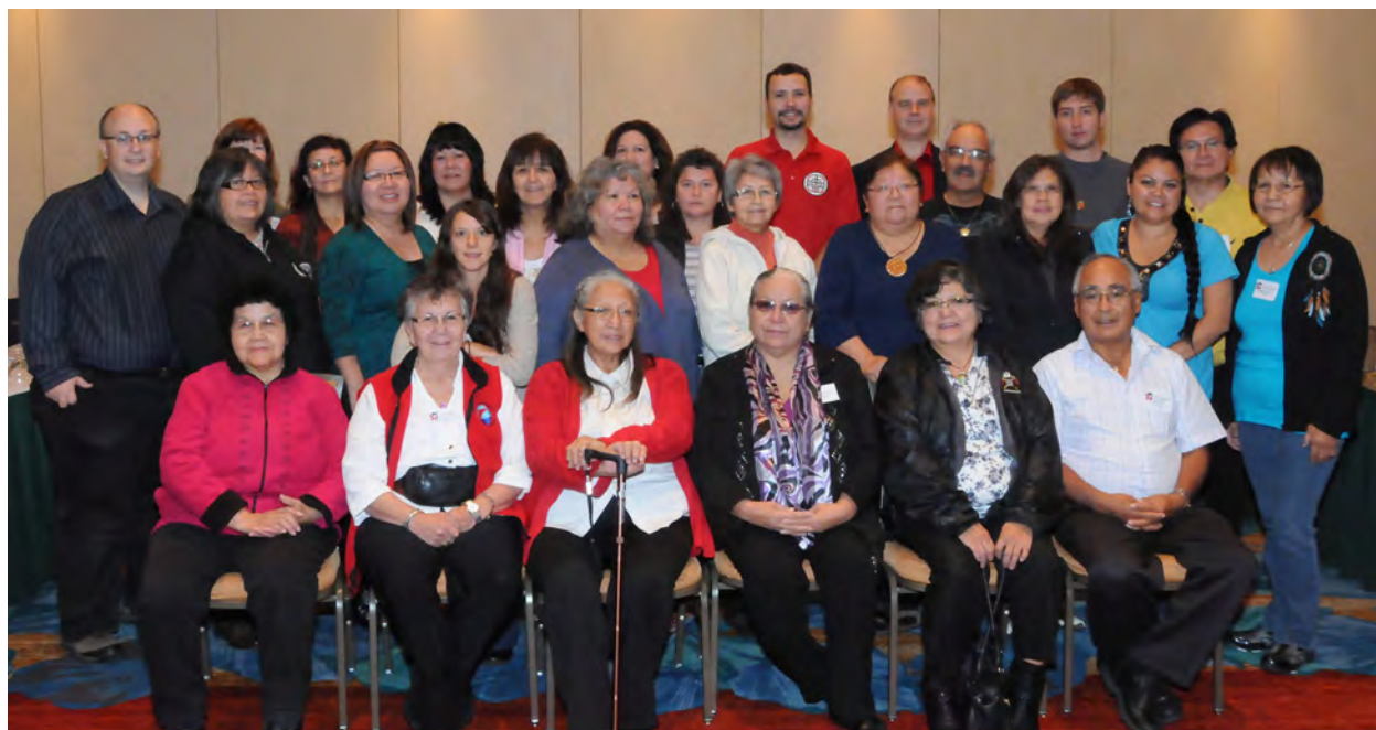
Staff, Board and Advisory Committee at the 2012 Annual General Meeting

Advisory Committee members are listed on page 11 with the language group they represent.