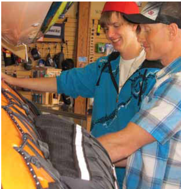
Through its student wage subsidy programs, CBT helped Cranbrook's Just Liquid Sports hire a student.

CBT continues to be committed to strengthening the economic well-being in the Basin, recognizing that economic trends directly impact the livelihoods of many residents. For example: