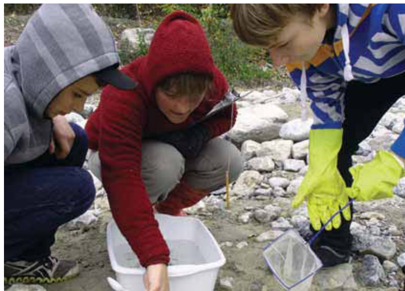
Grade eight Golden Secondary School students test the water and find organisms at North Hospital Creek as part of CBT's Know Your Watershed program.