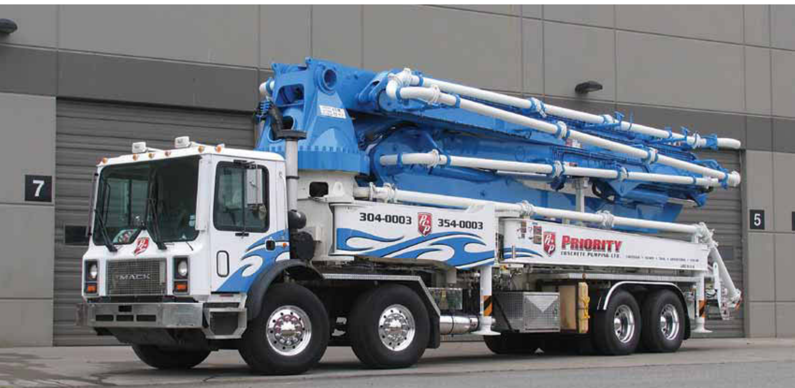
When Nelson's Priority Concrete Pumping Ltd. wished to expand, it turned to CBT to receive financing to purchase a new boom pump.

This category includes a range of investments, such as short-term deposits, bonds and equities. The portfolio is managed by the British Columbia Investment Management Corporation on behalf of CBT.