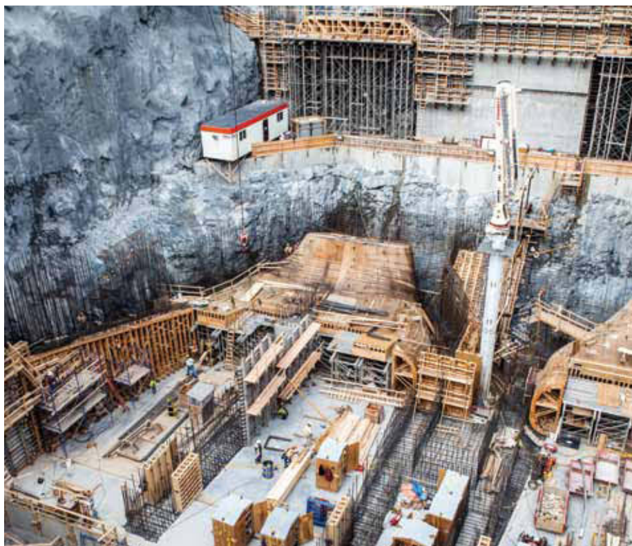
Construction has been proceeding on time and on budget at the Waneta Expansion Project near Trail.