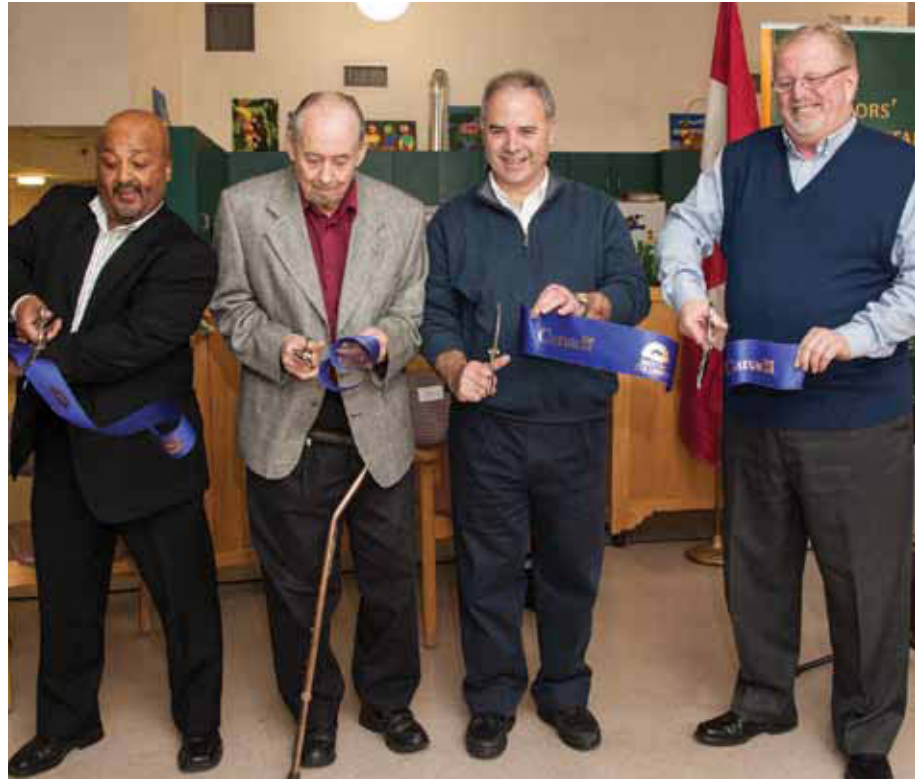
Representatives celebrate the official opening of Revelstoke's Moberly Apartments and Mount Begbie Villas, which were funded under the Seniors Rental Housing Initiative.