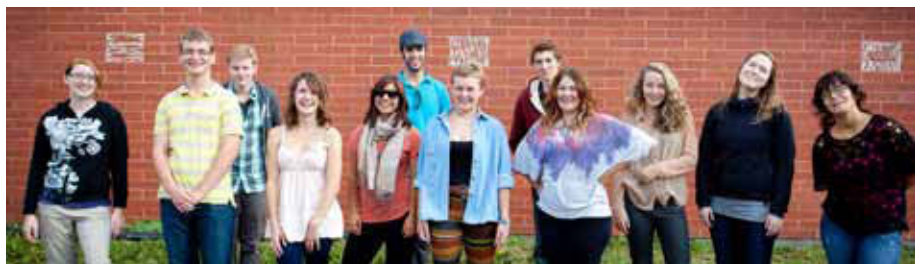
One way CBT engages youth is through its Youth Advisory Committee.