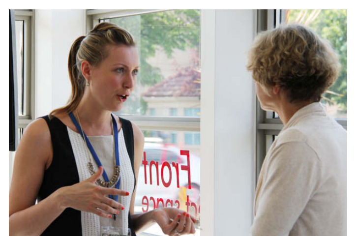
Summer Seminar 2012 Kelowna BC

BCCIE is committed to advancing the International Education interests of the public and private education institutions at the K-12 and the post-secondary levels, the Province of British Columbia, and all regions and communities across the province, in support of government policy and strategic direction, including that outlined in the BC International Education Strategy .