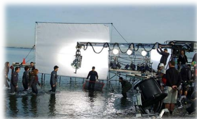
A television crew on location.