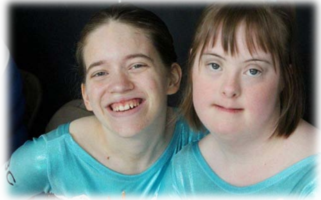
The Ministry has provided funding to Special Olympics BC to host the 2014 Special Olympics Canada Summer Games in Vancouver, and to support B.C.’s Special Olympics athletes.