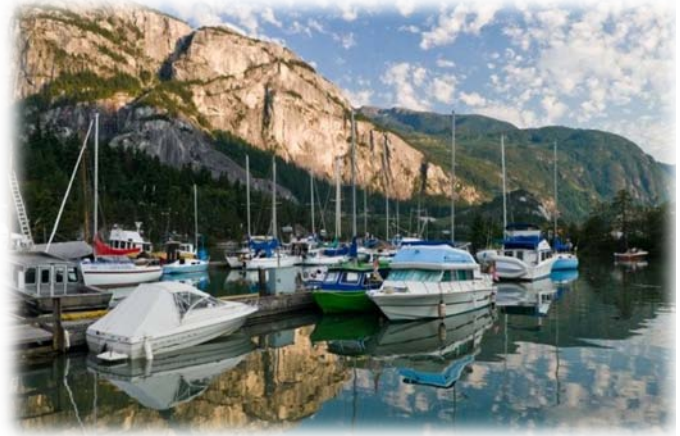
Squamish, recognized as the Outdoor Recreational Capital of Canada, is one of many British Columbian municipalities that are closely linked to the natural environment.

The Ministry recognizes the great diversity of circumstances and aspirations among B.C. communities and strives to meet their individual needs. The Parliamentary Secretary for Rural Communities and