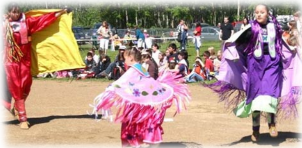
Local First Nations dancers participate in a dance on Aboriginal Activity Day in Chetwynd.

To further strengthen local capacity, the newly appointed Auditor General for Local Government will provide advice and best practices to help local governments find effective, progressive solutions to improve local stewardship of assets and service delivery. It will help local governments identify the most efficient and effective ways to address priorities important to their communities.