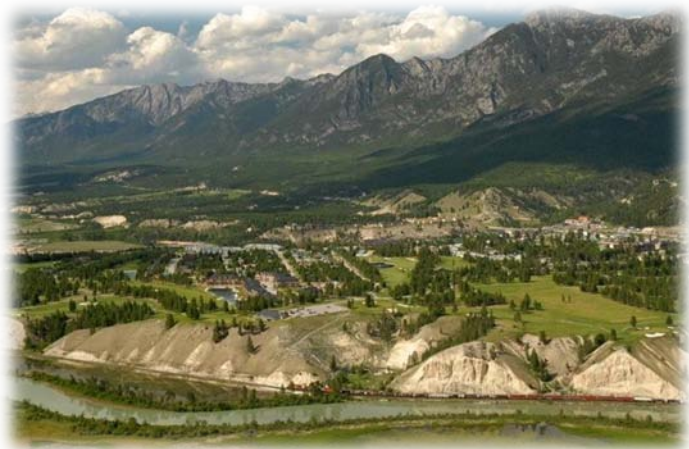
Radium Hot Springs recently celebrated the re-opening of the Canfor mill , which will employ 144 people.

To compete successfully for potential investment, B.C.'s communities must also