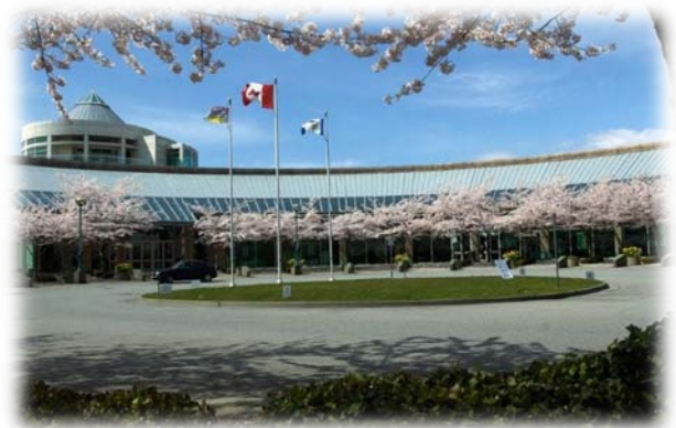
Port Moody City Hall