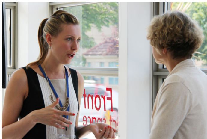
Summer Seminar 2012 Kelowna BC

BCCIE is committed to advancing the International Education interests of the public and private education institutions at the K-12 and the post-secondary levels, the Province of British Columbia, and all regions and communities across the province, in support of government policy and strategic direction, including that outlined in the BC International Education Strategy .