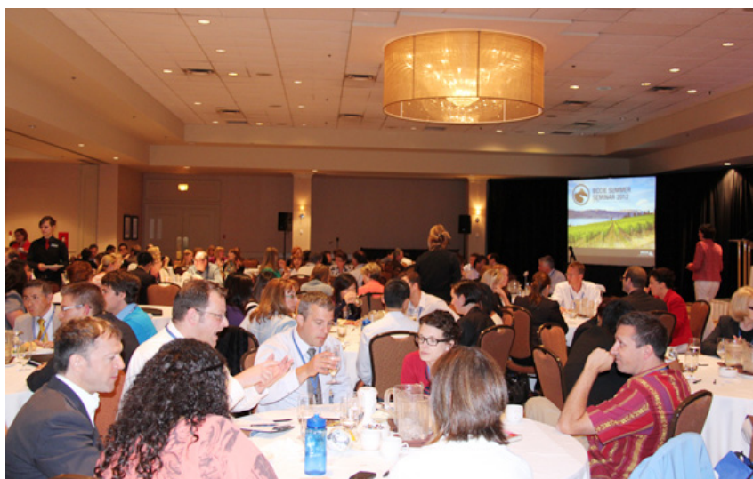
Summer Seminar, BCCIE's annual professional development conference, brings together over 250 participants from our province, from across Canada and from beyond our borders.

One of BCCIE's main priorities over the 2013/14 fiscal year will be to establish best practices, track performance against the goals outlined herein, and to establish realistic benchmarks and further define performance measures. BCCIE will track performance on a quarterly basis, comparing against the performance measures and targets outlined herein to establish reasonable benchmarks.