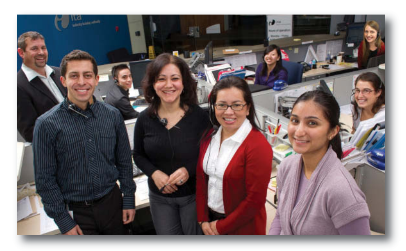
ITA customer service representatives