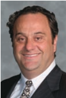
Donald Hayes Chair

Over the next three years, our focus will be on developing exhibitions that reflect the breadth and depth of our own research and collections. During the same time period, we’ll also be preparing for travelling exhibitions scheduled to be shown at the Royal BC Museum in 2012 and 2013.