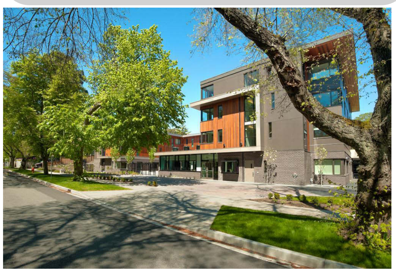
Camas Gardens, a supportive housing building near downtown Victoria, was constructed to high sustainability standards. The building's 44 units provide self-contained bachelor and one-bedroom apartments for individuals who are homeless or at risk of homelessness, including those who may be facing mental health or addiction challenges. The building is managed by Pacifica Housing, funded in part by BC Housing. Camas Gardens won the 2012 Canadian Wood Council BC Wood Design Award in the multi-family category.