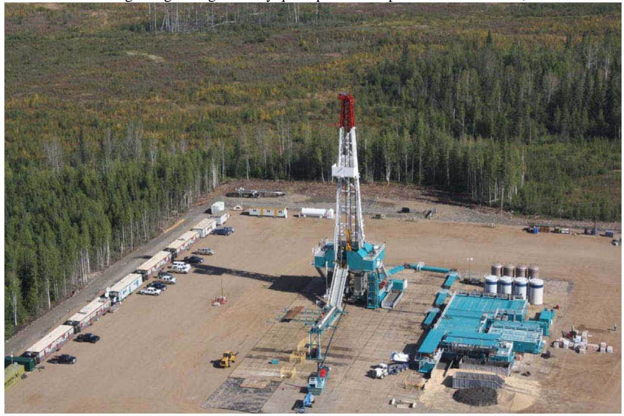
An exploration rig drilling a shale gas well in the Kiwigana area of the Horn River Basin, in northeast B.C. This rig is powered by natural gas, an example of industry efforts to reduce emissions and the overall footprint of development.

The Ministry is committed to working with natural resource sector agencies, communities, First Nations, industry and environmental organizations to ensure that the continued growth, exploration and development of our natural gas sector is socially and environmentally responsible. The Province has significant shale and tight gas deposits—such as in the Horn River and Montney areas of Northeast B.C. Natural gas can be converted into liquid state (LNG) for transportation to Asia where demand for natural gas is growing at a very quick pace. LNG provides an abundant, lower carbon fuel