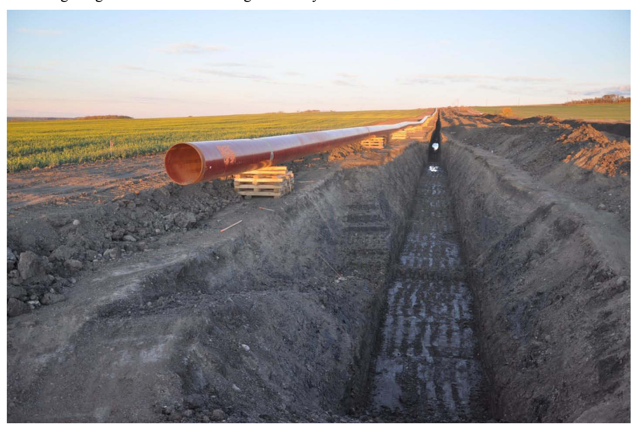
At least one pipeline and one LNG plant are projected to be in operation by 2015, according to one of the strategies for Goal 1 of the Ministry of Natural Gas Development: An internationally competitive natural gas sector that contributes to jobs and the economy.

LNG development in B.C. can have lower lifecycle greenhouse gas emissions than anywhere else in the world by promoting the use of clean electricity at LNG plants. British Columbia has many strategic advantages fostering the development of an LNG industry, but must ensure its competitiveness with other natural gas producing jurisdictions that are also working to attract LNG export investments. As described in Liquefied Natural Gas: A Strategy for B.C.'s Newest Industry , the development of LNG export capacity in BC to access stronger markets in Asia is critical to sustaining the growth of BC's natural gas industry.