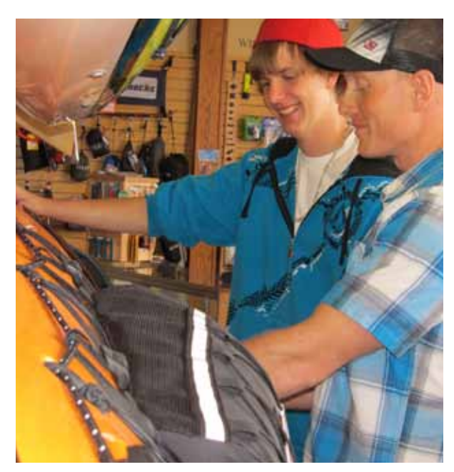
Through its student wage subsidy programs, CBT helped Cranbrook's Just Liquid Sports hire a student.

CBT continues to be committed to strengthening the economic well-being in the Basin, recognizing that economic trends directly impact the livelihoods of many residents. For example: