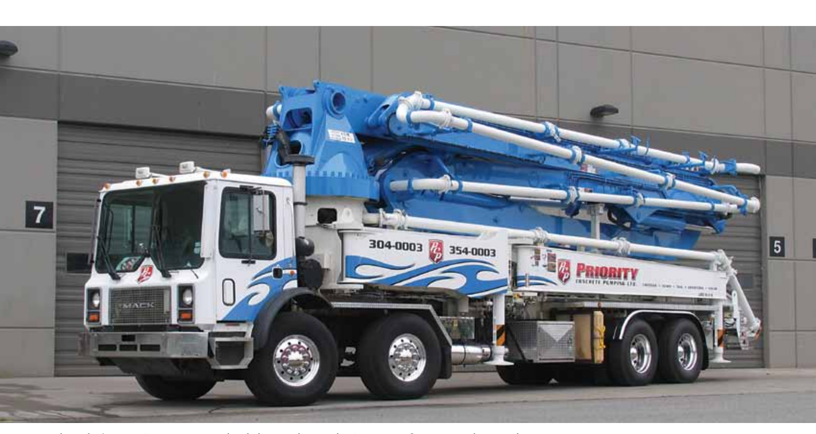
When Nelson's Priority Concrete Pumping Ltd. wished to expand, it turned to CBT to receive financing to purchase a new boom pump.

This category includes a range of investments, such as short-term deposits, bonds and equities. The portfolio is managed by the British Columbia Investment Management Corporation on behalf of CBT.