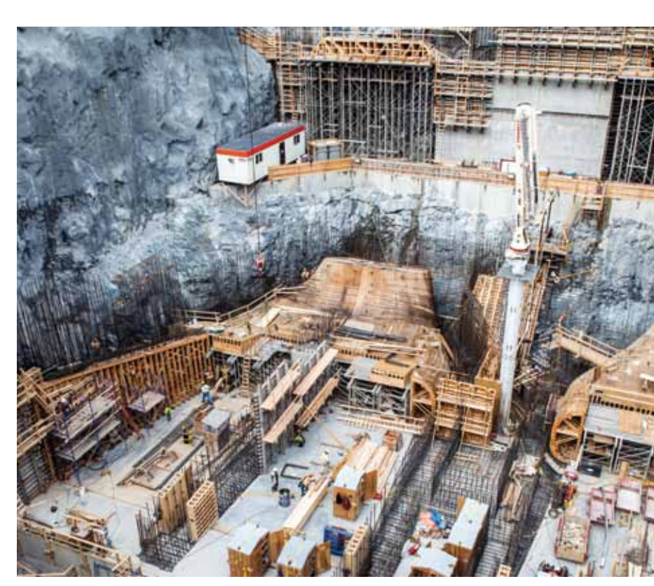
Construction has been proceeding on time and on budget at the Waneta Expansion Project near Trail.

CBT believes future generations should benefit from the same level of support as current residents. To preserve this legacy, investment policies and grant/ spending policies should be aligned to result in the retention of sufficient funds to offset the effects of inflation in the long term.