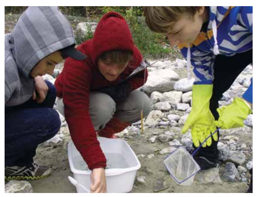
Grade eight Golden Secondary School students test the water and find organisms at North Hospital Creek as part of CBT's Know Your Watershed program.